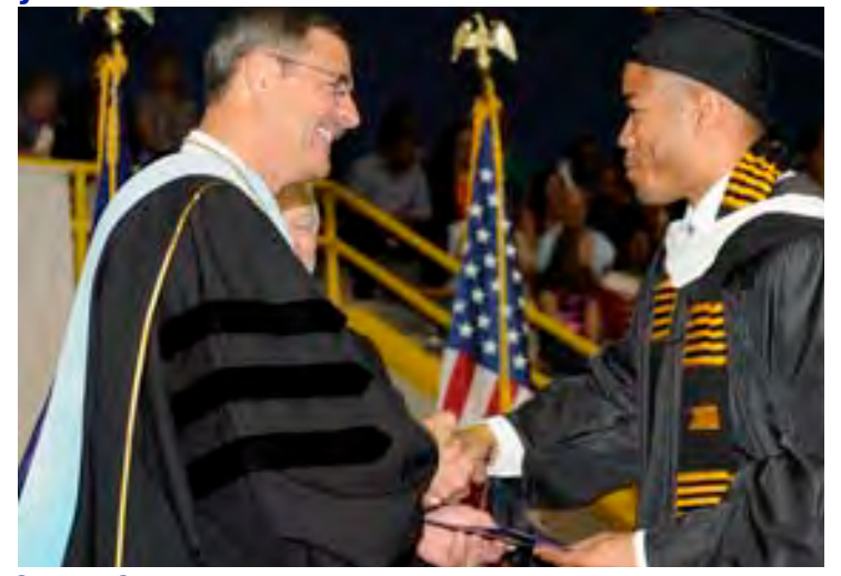
Spring Commencement recognizes more than 1,100 MSU honored more than 1,100 degree candidates at its two spring commencement ceremonies at the Academic-Athletic Center on May 12, 2012.

MSU's College of Education has proven its commitment to producing quality teachers for our nation's children by achieving accreditation in May under the performance-oriented standards of the National Council for Accreditation of Teacher Education (NCATE). NCATE is the organization responsible for professional accreditation of teacher education.