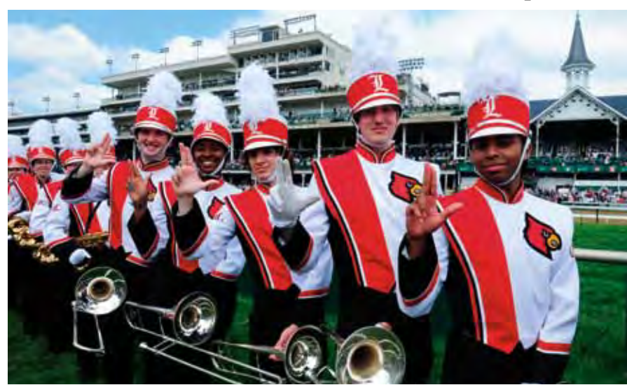
Uoff.'s Cardinal Marching Band takes its biggest stage every year just minutes before the Kentucky Derby, playing the Stephen Foster classic "My Old Kentucky Home" near the Derby Winner's Circle. Since 1936, the band has played the song at the Derby as the horses are led in the post parade.