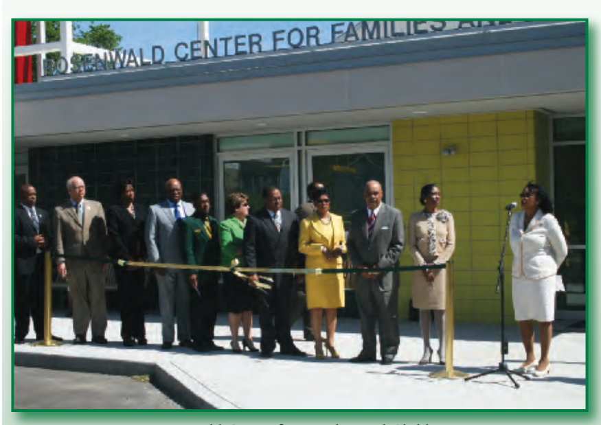
Rosenwald Center for Families and Children